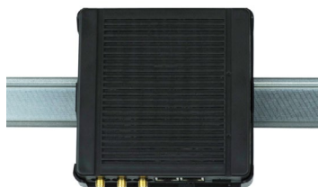
DIN Rail Mount